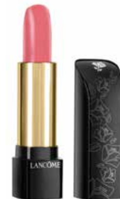
Lancôme Absolu de Rouge in Rose Nu