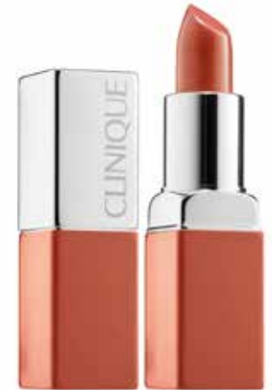
Clinique Pop Lip Colour in Nude Pop