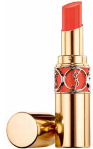
YSL Rouge Volupté Shine in 12