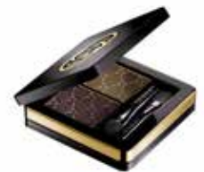
Gucci Magnetic Color Eyeshadow Duo in Fume