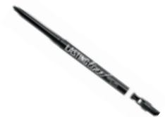
Bare Minerals Lasting Line Longwearing Eyeliner in Absolute Black