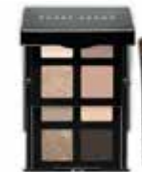
Bobbi Brown Sandy Nudes Eye Palette