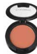
MAC Powder Blush in Peaches