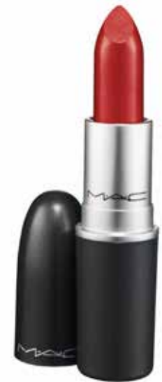
MAC Lipstick in Ruby Woo