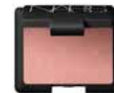
NARS Blush in Orgasm