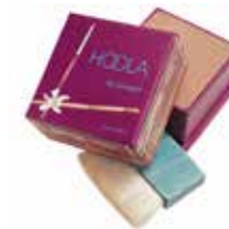
Benefit Hoola Bronzing Powder