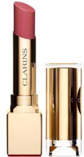
Clarins Rouge Eclat in Woodrose