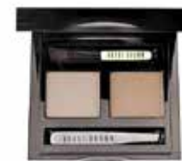
Bobbi Brown Brow Kit in Dark